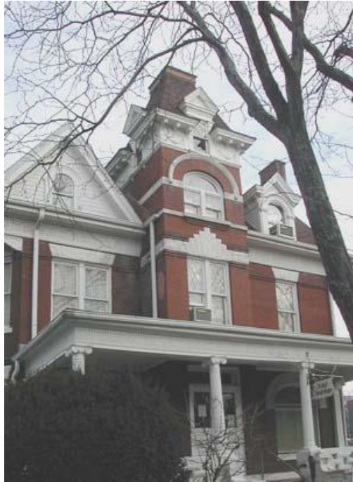
Halle Steensland House, Madison