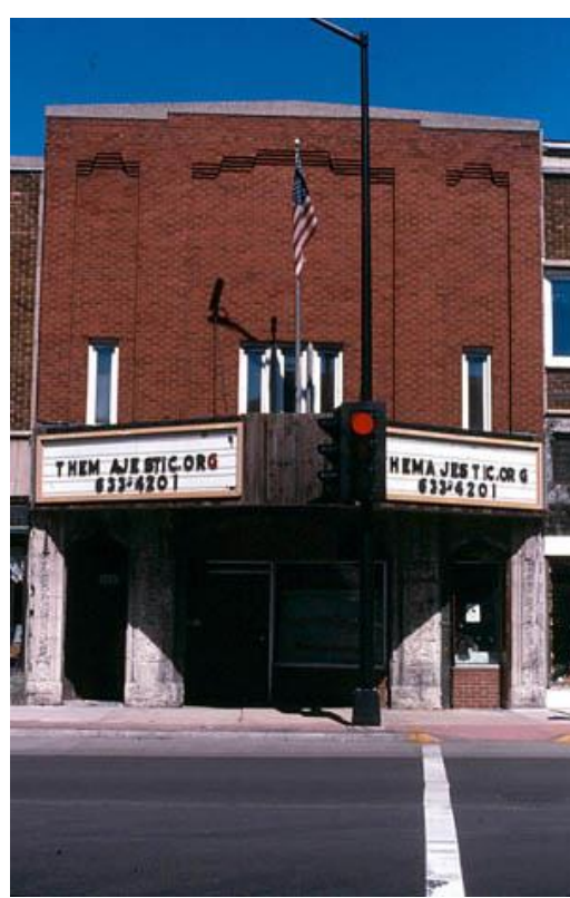
Uptown Theater, Racine