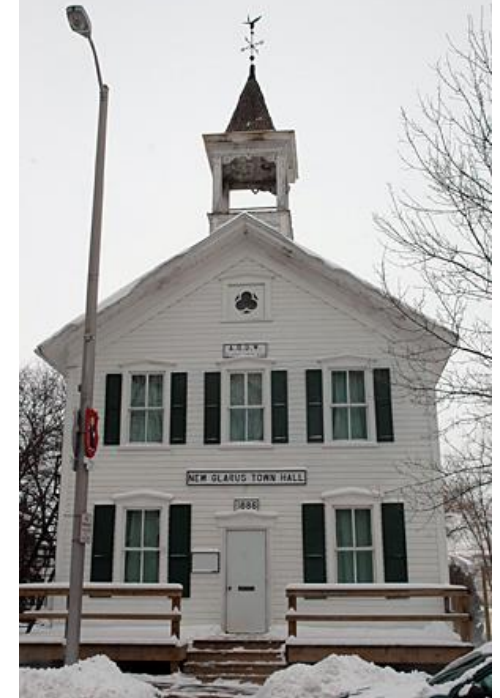
New Glarus Town Hall, New Glarus