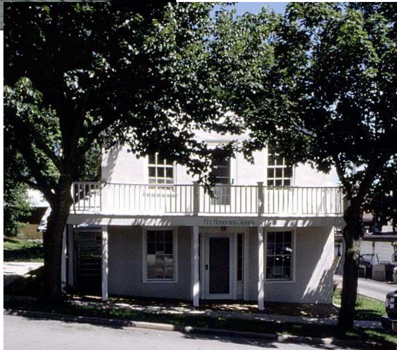
Dr. Samuel Blumer House, New Glarus