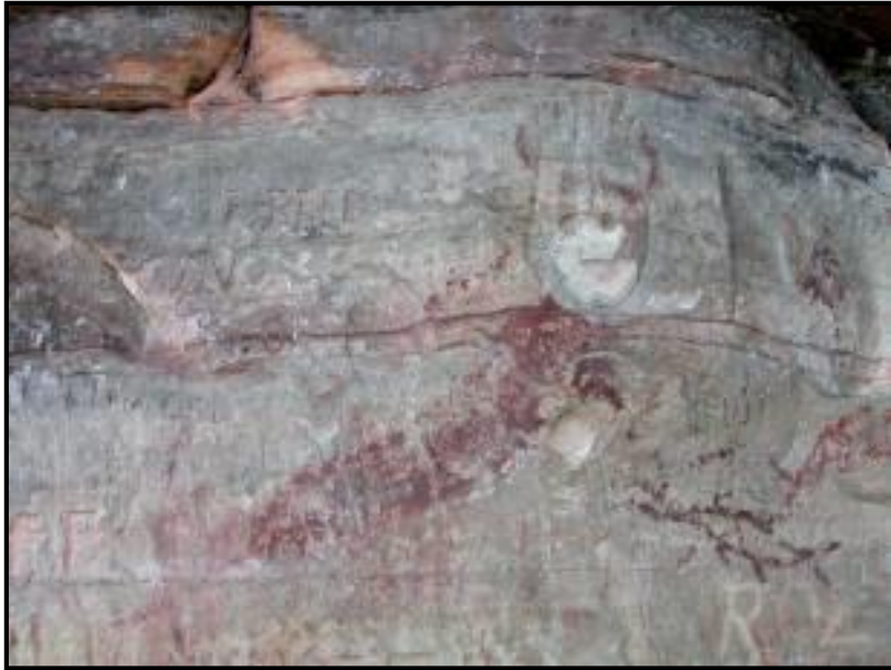
Lemonweir Rock Art Site, Juneau County