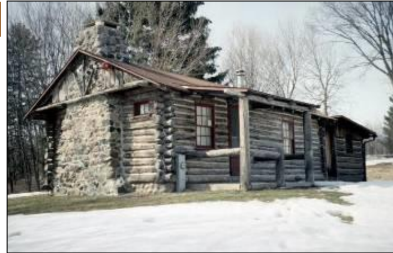
Ben Hunt Cabin, Hales Corners