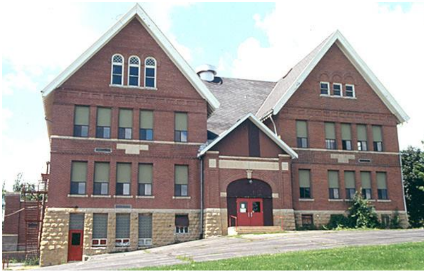
New Glarus Public School and High School, New Glarus