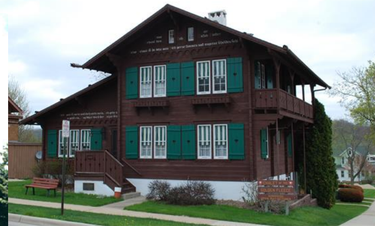
Chalet of the Golden Fleece, New Glarus