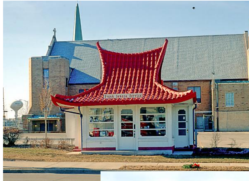
Wadhams Gas Station, West Allis