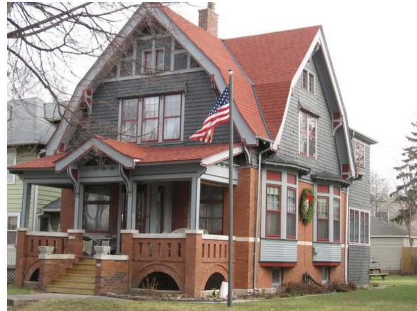
Alexander Herschel and Pauline G. McMicken House, West Allis