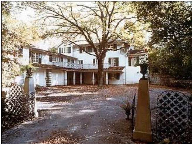
Ten Chimneys, Town of Genesee