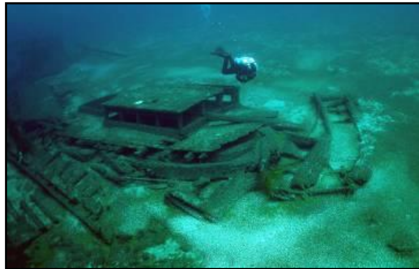
Oceanwave Skow Schooner, Lake Michigan