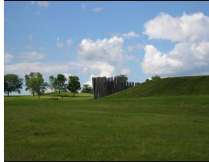
Aztalan, Jefferson County